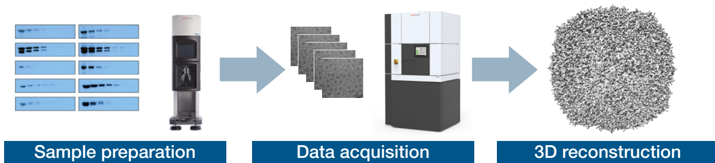
Figure 2. Schematic representation of the SPA workflow. After the biochemical steps of protein purification and verification, the samples are ready for cryo investigation. Cryo-grids are prepared using the Thermo Scientific Vitrobot™ System. Subsequently, they are transferred into the Glacios Cryo-TEM for sample optimization and high-resolution data acquisition followed by 3D reconstruction of the protein.

Falcon 4 is fully integrated with Thermo Fisher Scientific application software, such as EPU 2, which make daily operations easy and efficient.